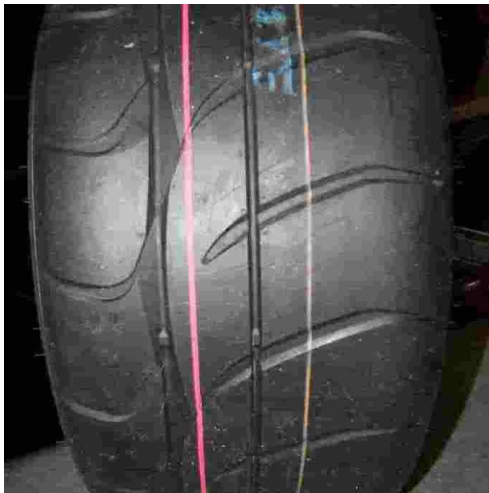
Full tread depth