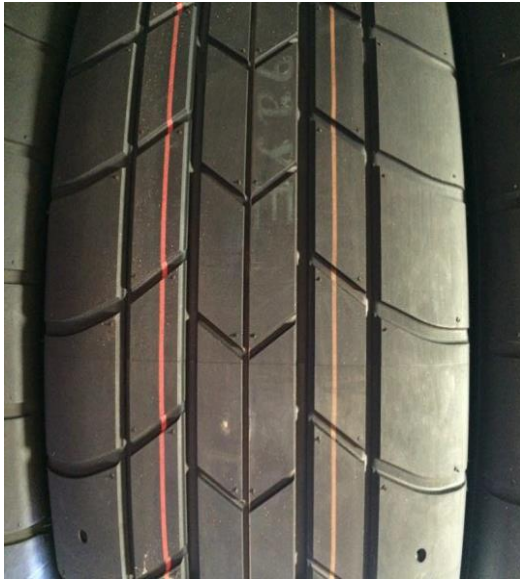
Full Tread Depth