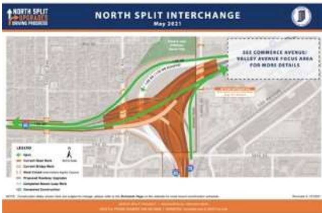
North Split Closure Detour Routes